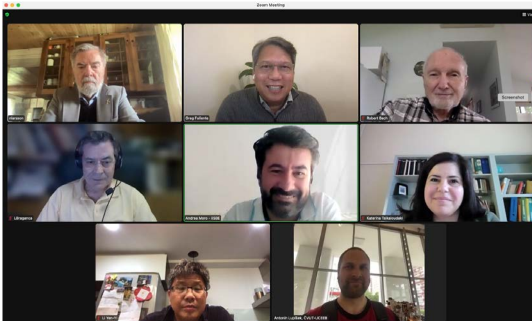
Some of the iISBE Board Members in one of our three online Board meetings in 2022. For a full list of current Board Members, see Appendix A.